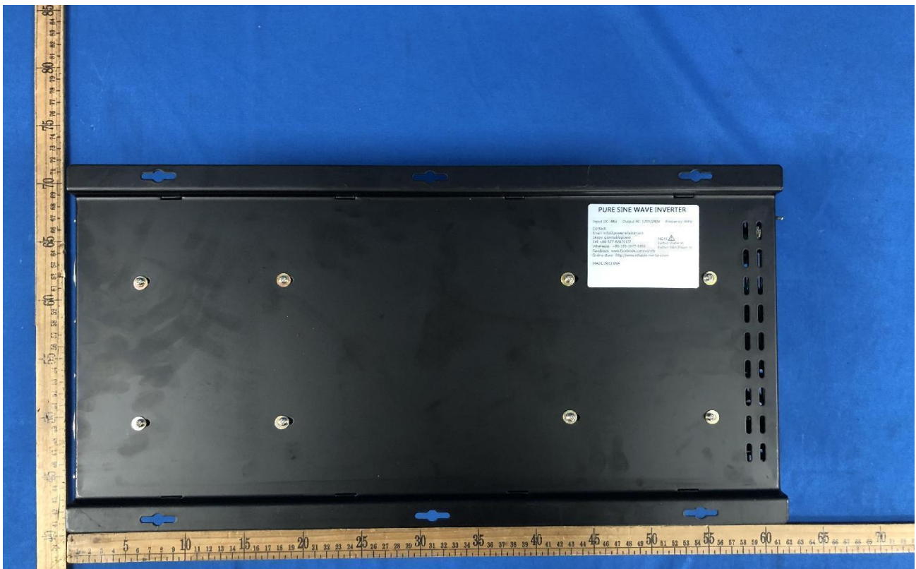
Fig 2. General view