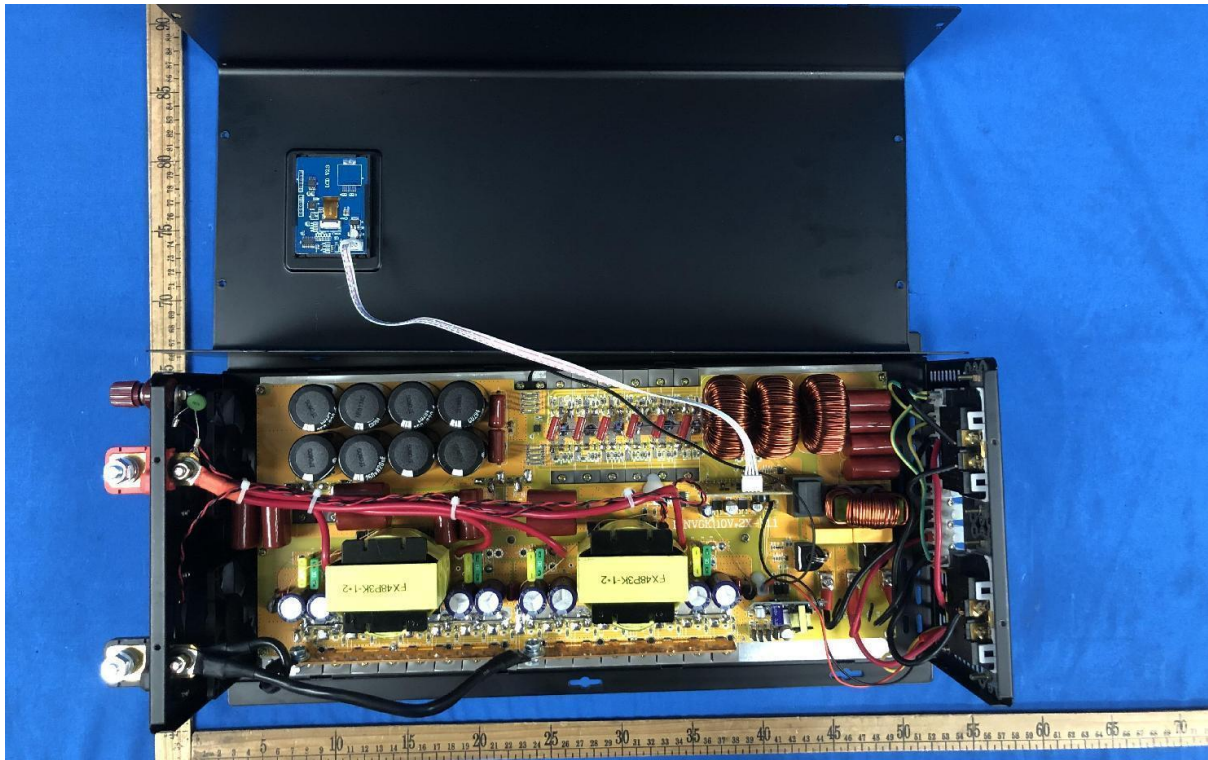
Fig 5. Internal view