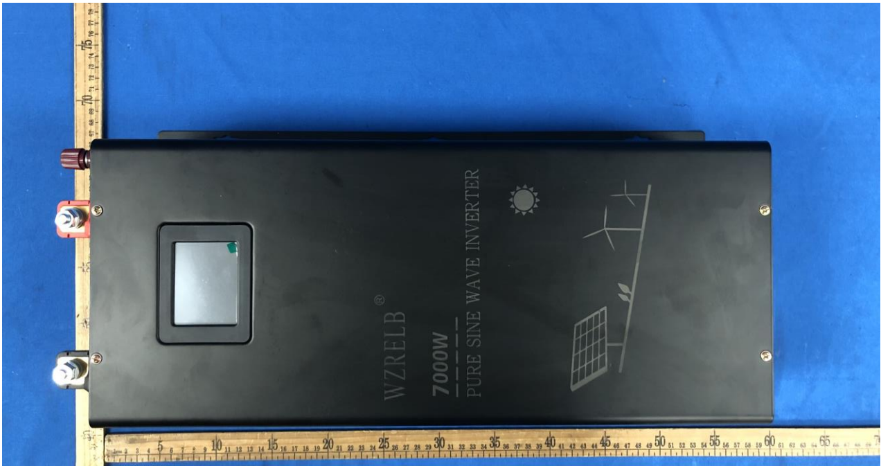
Fig 1. General view