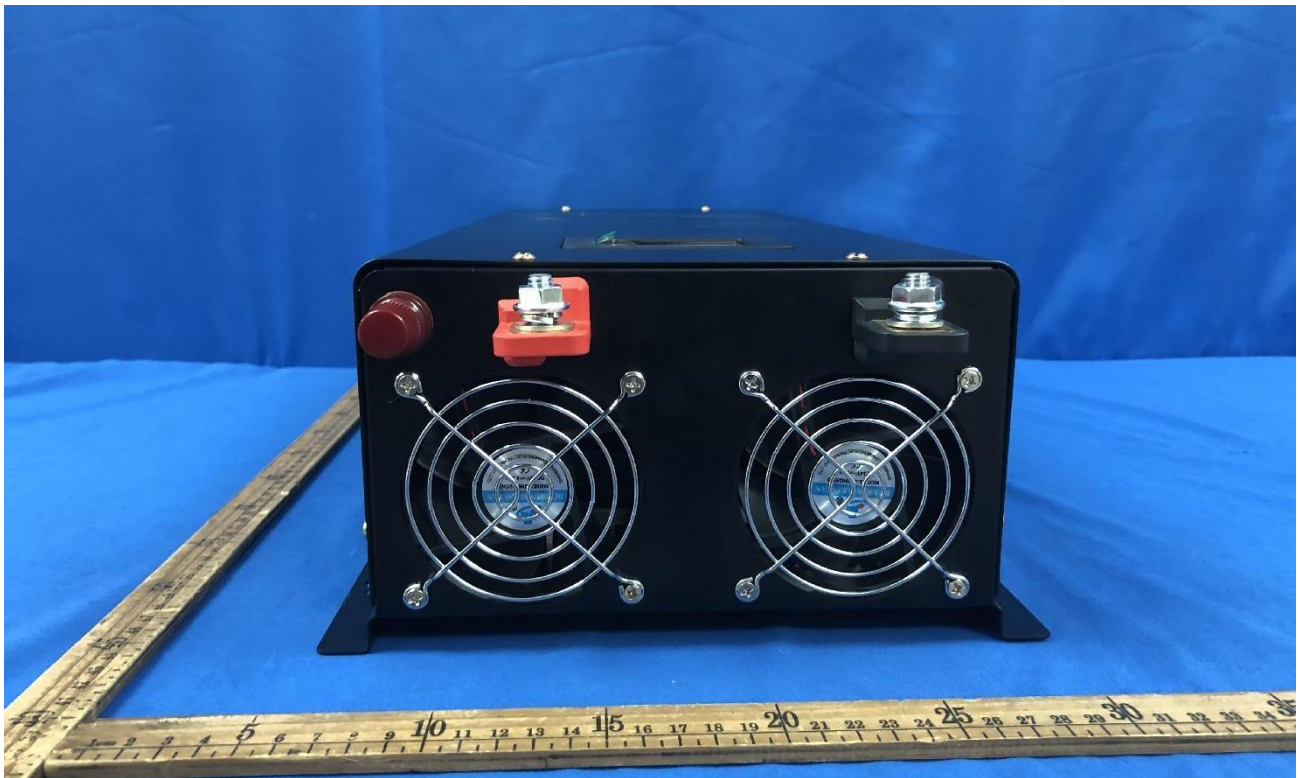
Fig 4. General view