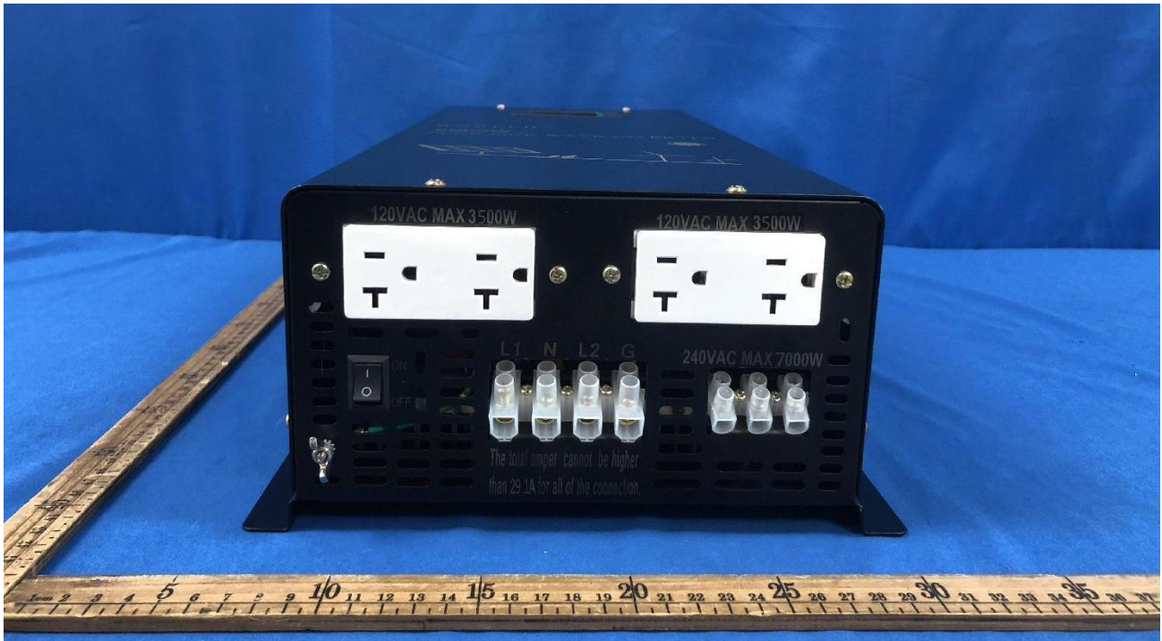
Fig 3. General view